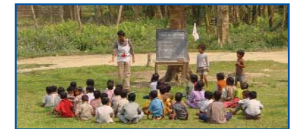
Assam, India

This report will be launched on World Health Day, 7 April 2004. It will be the first major report on the topic produced and issued by the WHO in collaboration with the World Bank. Report can be obtained by contacting the WHO at VIP@who.int