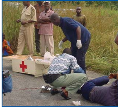
Cote d'Ivoire

One of the most common causes of death for victims of a road crash is anoxia – a lack of oxygen supply – caused by a blocked airway. On average, it takes less than four minutes for a blocked airway to be fatal. Even in areas with highly structured emergency care, the norm for ambulance response to a road crash is ten minutes. Many people will die if nothing is done to correct the slow response time to anoxia. The application of first aid techniques, in particular the proper positioning of the victim prior to the arrival of the emergency response teams, can mean the difference between life and death in a road crash.